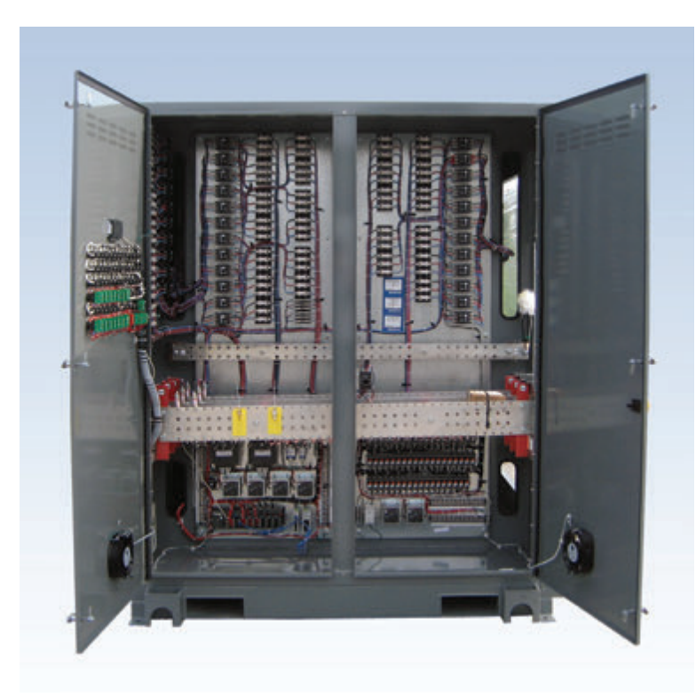
LBW-2500 Control Section