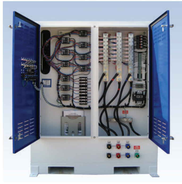
LBW-400 Control Section