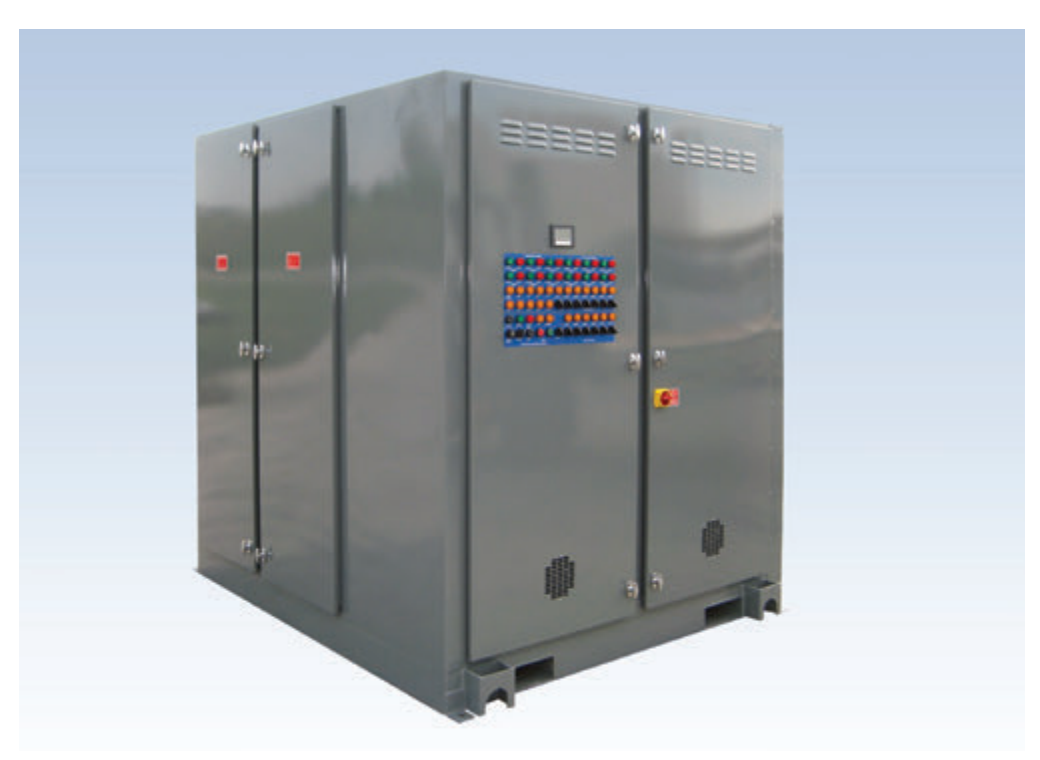
LBW-2500 (half module shown)