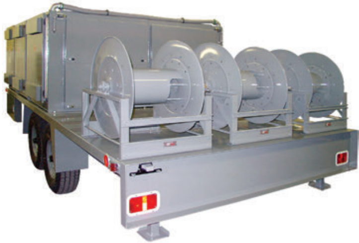
Bottom Photo: Optional full enclosure with lockable doors for cable reels.