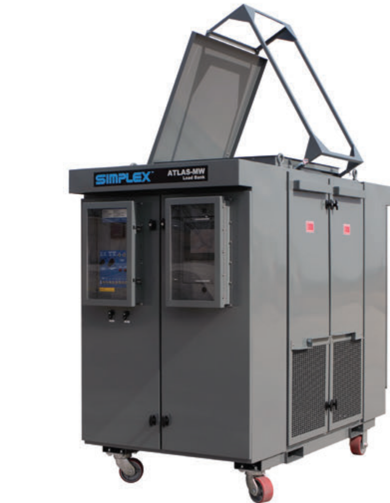
Atlas-Megawatt with optional weather resistant configuration and optional toggle switch control.

Load Elements: Simplex "Powr-Web" chromium alloy, open wire, continuously supported, power resistor. See page 2 for details.