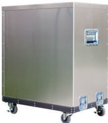
PowerStar 110 with aluminum "slip-over" cover with handles for added protection while transporting.